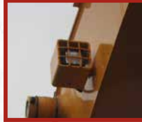
MAIN BOOM HD LIGH GUARD