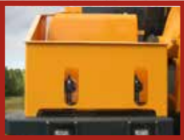
HD BRUSH GUARD (front right, 3/16" plate design)