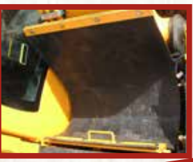
Hydraulic tank fill cap