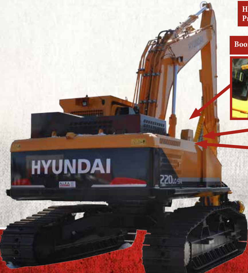
Boom Rubber Guard