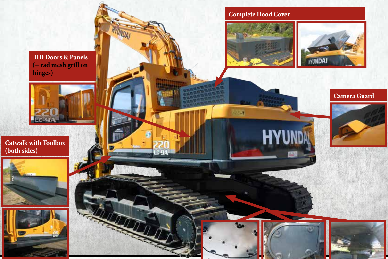
Complete Hood Cover