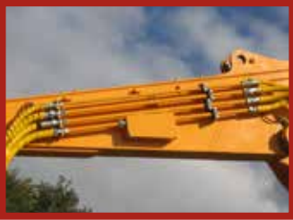
HYDRAULIC PIPE UPGRADE